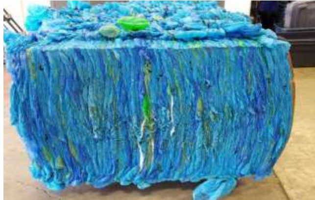
Seizure of Canada Customs