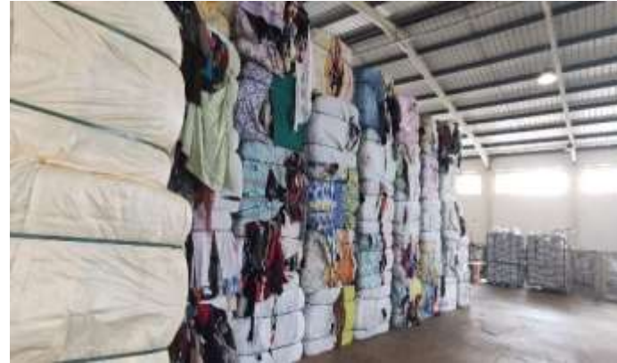
Seizure of Portugal Customs