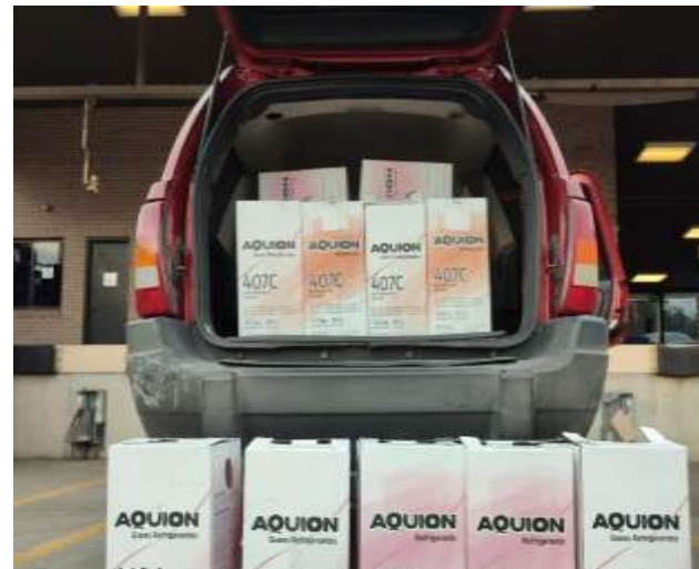
Seizure of Mexico Customs