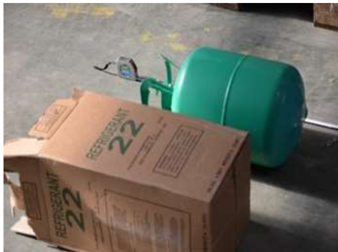
Seizure of Poland Customs